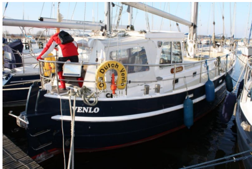
Purchased in Holland spring 2009