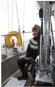
Sailing to Denmark April 2009