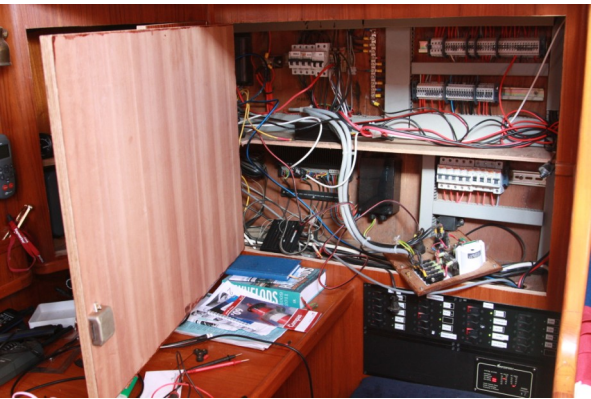
Rewired all electrics and new electronics