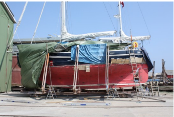
Bottom cleaned to steel and epoxy treated