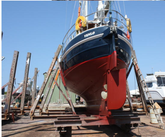
Renamed Chili - little and strong