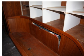
Central bunks changed with closing bunk Port and closets SB