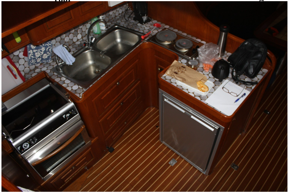
New Diesel stove and 24V fridge