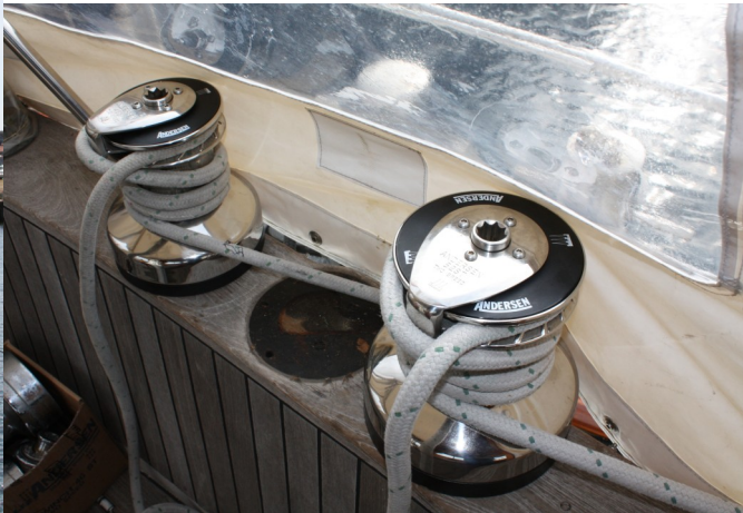
New Andersen Winches